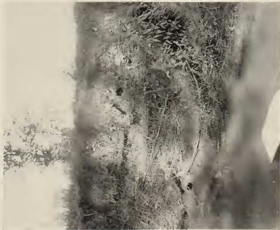
FIG. 1. Nesting Hole of the Belted Kingfisher.